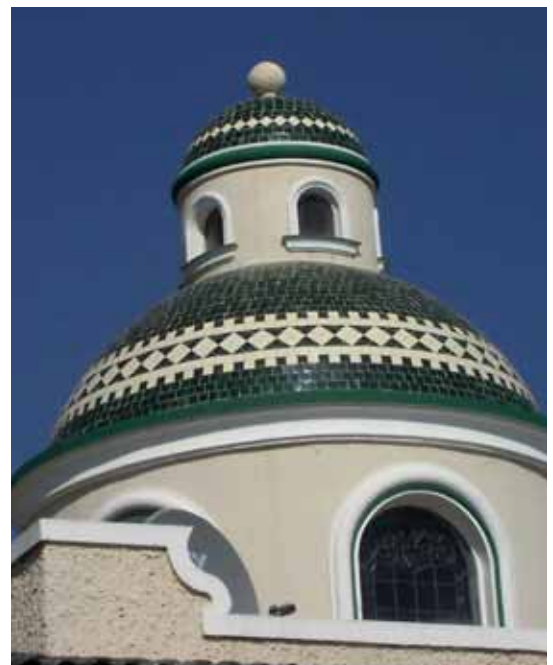
W DOME FINISHED